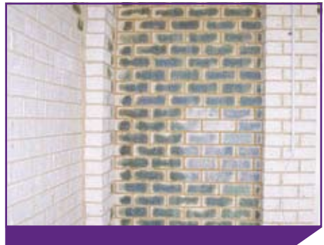
Vanadium stain not removed prior to hydrochloric acid application