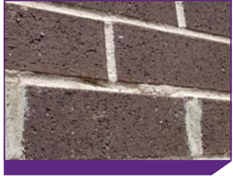
Damage to ironed mortar joint