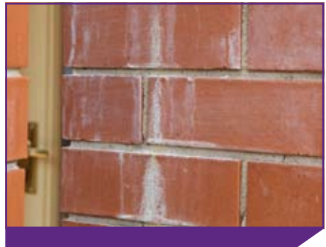
Calcium stains leaching from adjacent concrete balcony