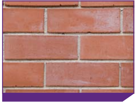
Typical calcium stain from wet sponging mortar joints