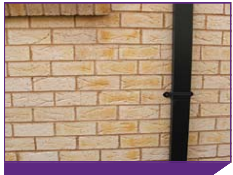
Acid burn on light coloured bricks