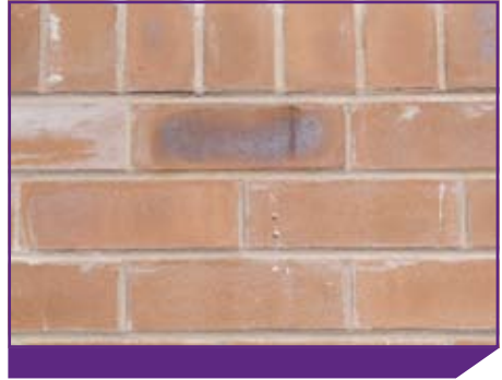
Signs of manganese staining