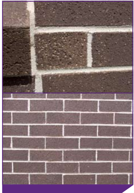
Damage to bricks caused by incorrect use of high pressure water jet cleaning