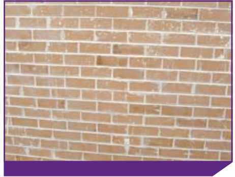
Typical wall after brick laying