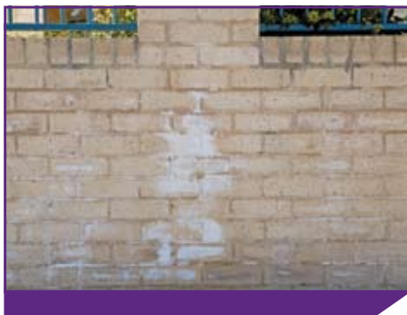
Efflorescence as seen on brick faces

Persistent efflorescence may be a warning that water is entering the wall through faulty copings, flashings or pipes.