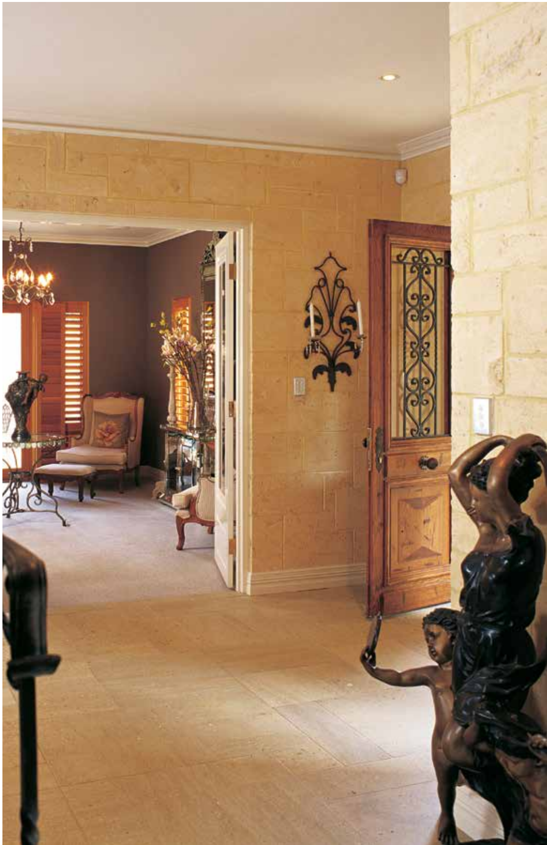
PRODUCT: NATURAL LIMESTONE