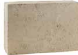
Scapestone 120 Unit size: 500 x 350 x 120