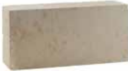
Wallstone Split Unit size: 500 x 165 x 245