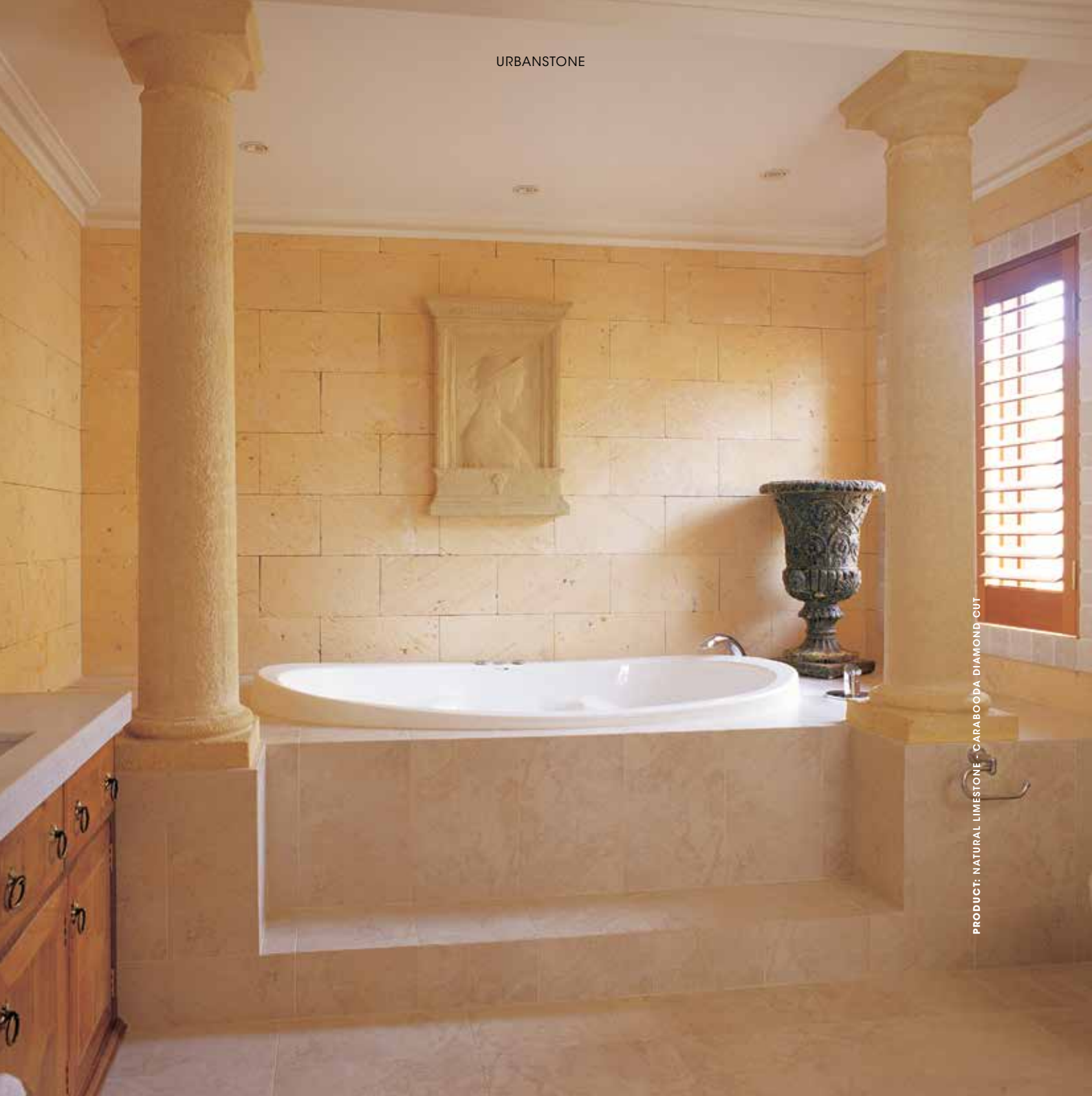
PRODUCT: NATURAL LIMESTONE - CARABOODA DIAMOND CUT