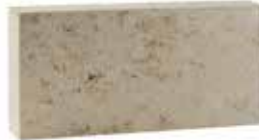
Scapestone 90 Unit size: 500 x 245 x 90