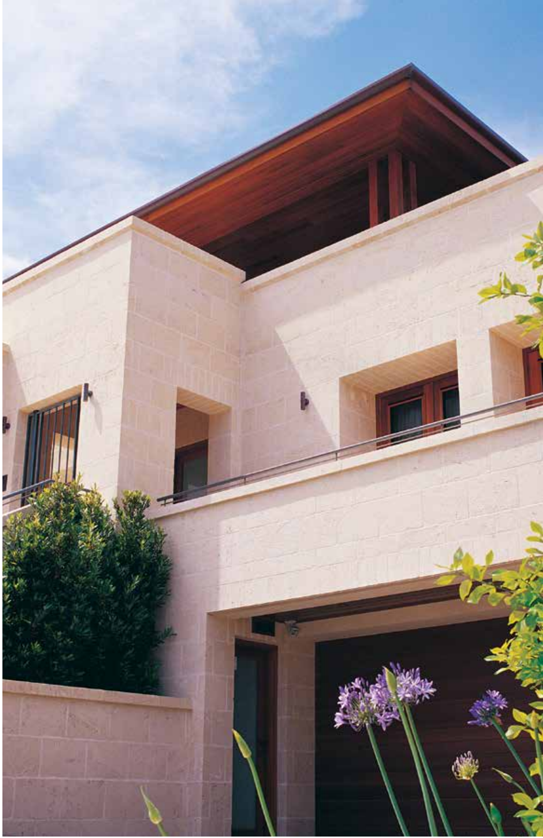
PRODUCT: NATURAL LIMESTONE - MOORE RIVER QUARRY CUT