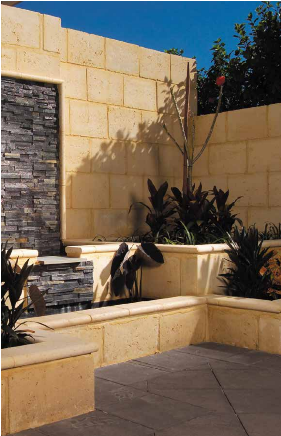
PRODUCT: ENGINEERED LIMESTONE - STANDARD