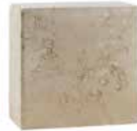
Pier 350 Unit size: 350 x 350 x 165