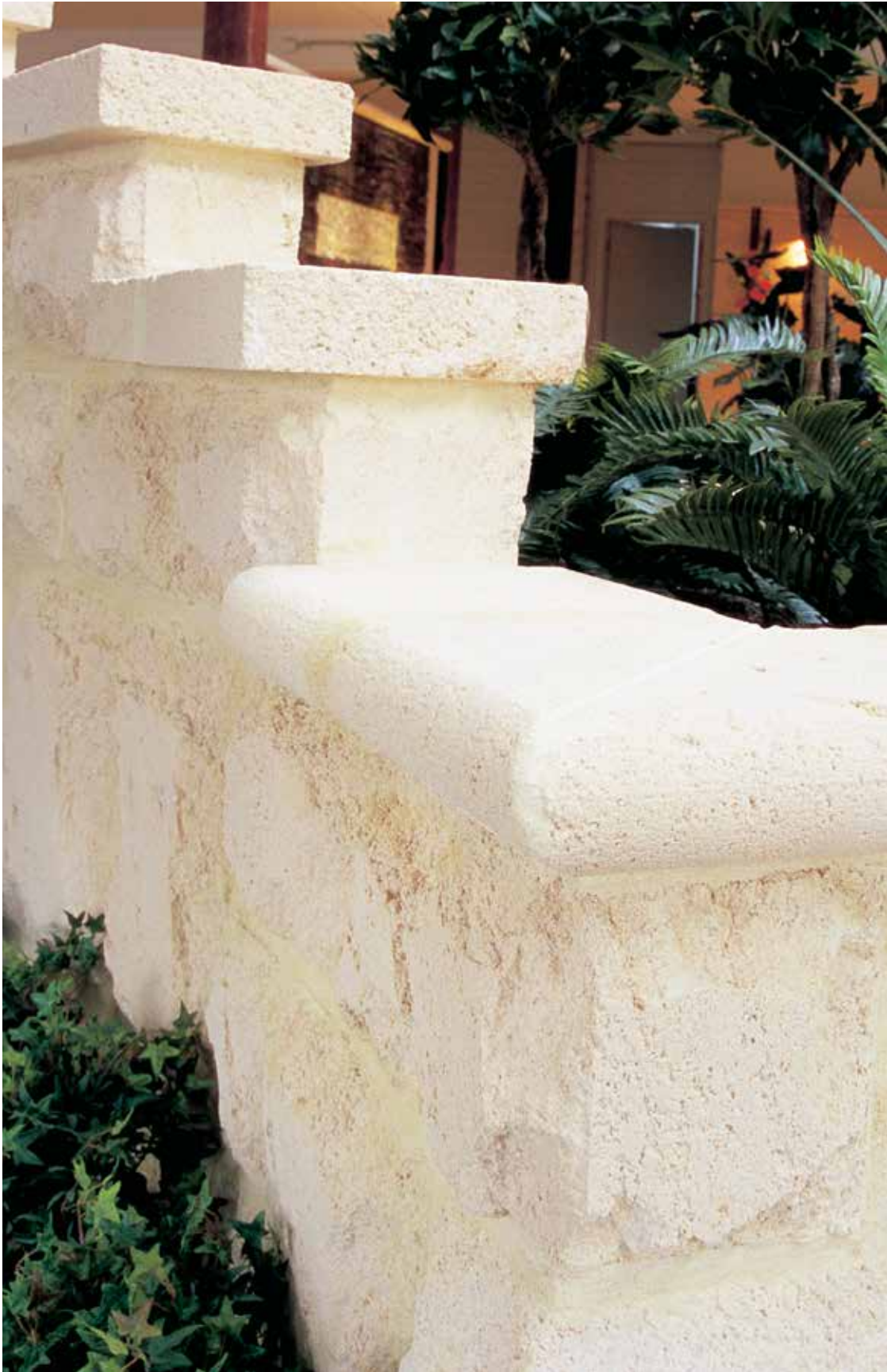
PRODUCT: NATURAL LIMESTONE - CARABOODA QUARRY CUT