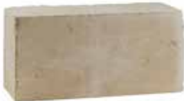
Wallstone 19 Unit size: 500 x 245 x 190