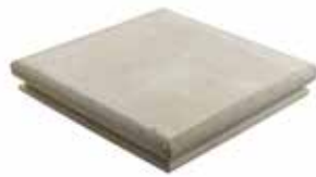
Pier Cap Unit

To view formats and sizes please go to page 21.