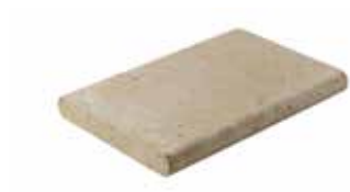
Single Bullnose Unit

This comprehensive range of stonework provides that finishing touch. Pier caps, bullnose step treads and coping units, all designed to give that extra edge.