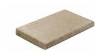
Bullnose Corner Unit