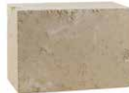
Wallstone 24 Unit size: 500 x 350 x 240