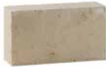
Brickstone Unit size: 290 x 162 x 90

The Limestone Collection is available in the following formats