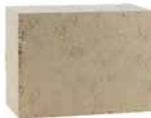
Wallstone Jnr Unit size: 400 x 300 x 190

To view formats and sizes please go to page 21.