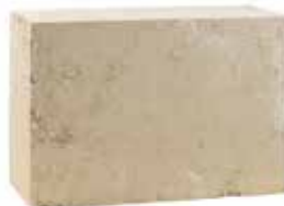
Wallstone 20 Unit size: 500 x 350 x 200