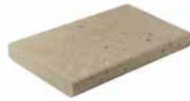
Double Bullnose Unit