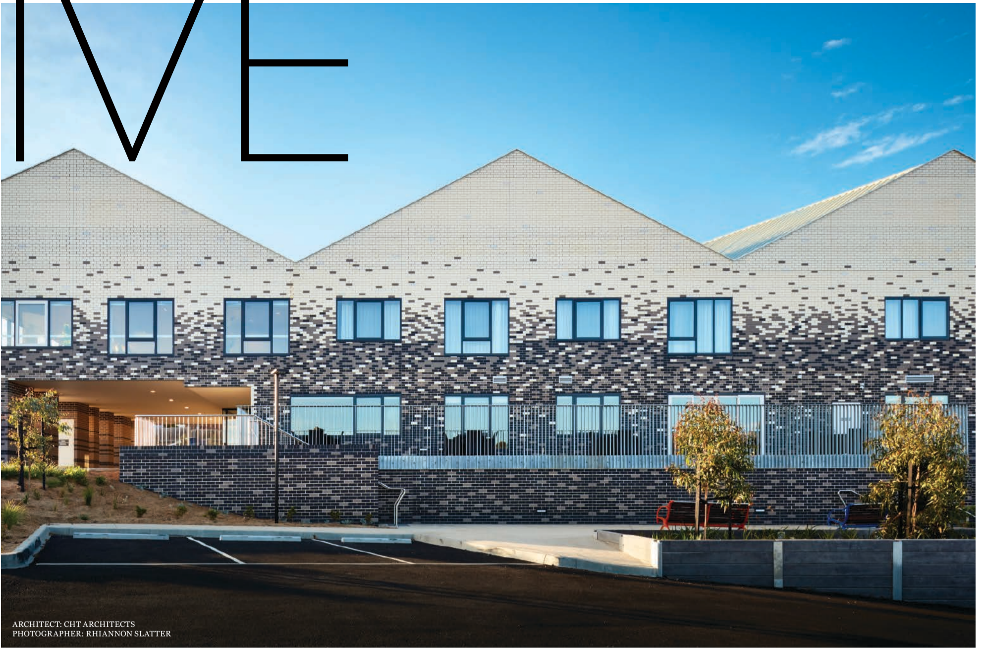
ARCHITECT: CHT ARCHITECTS