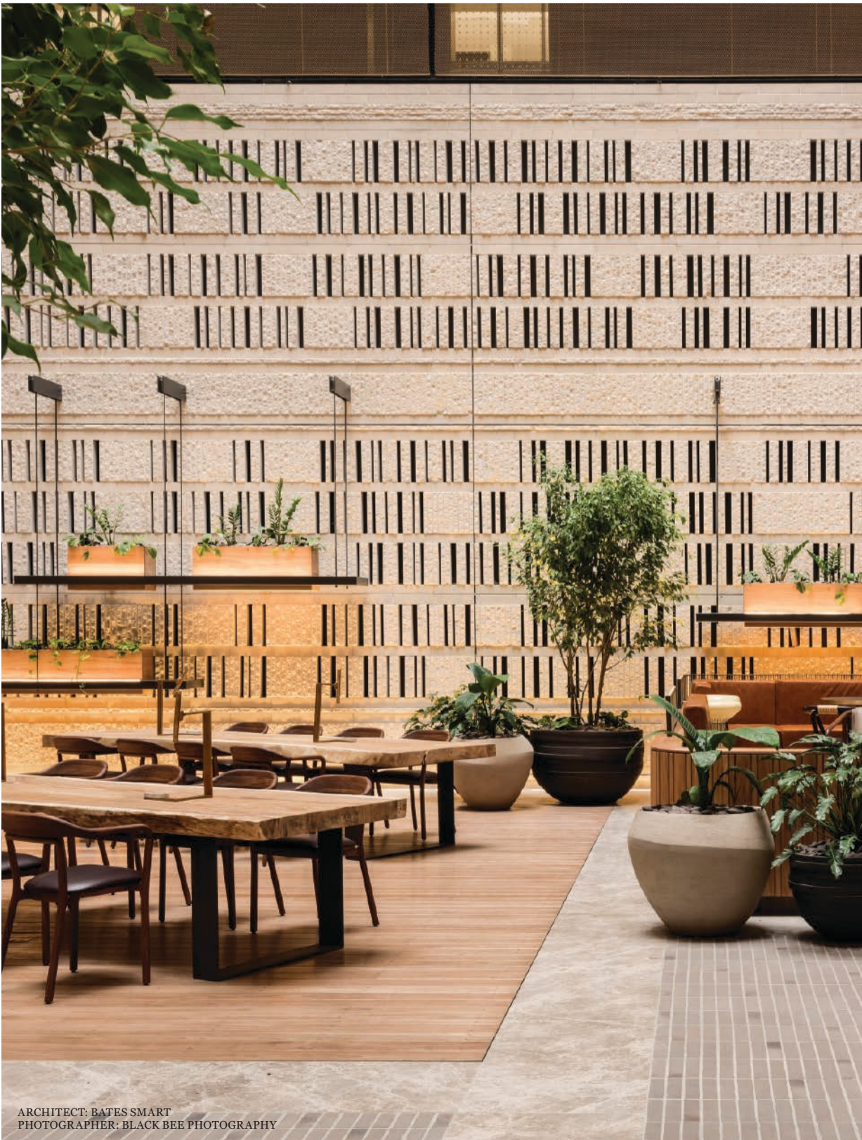
ARCHITECT: BATES SMART