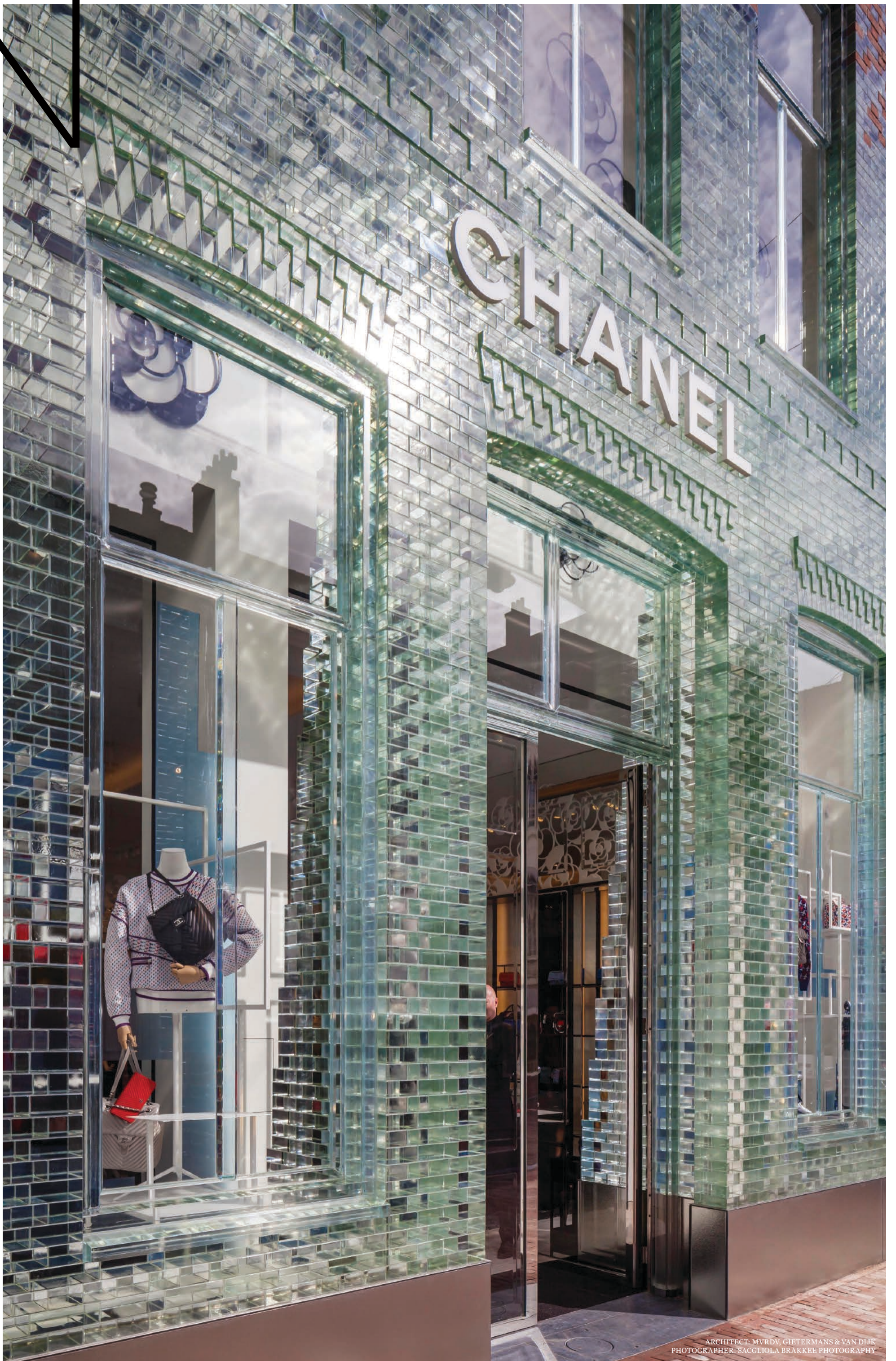
ARCHITECT: MYRDV, GIETERMANS & VAN DIJK