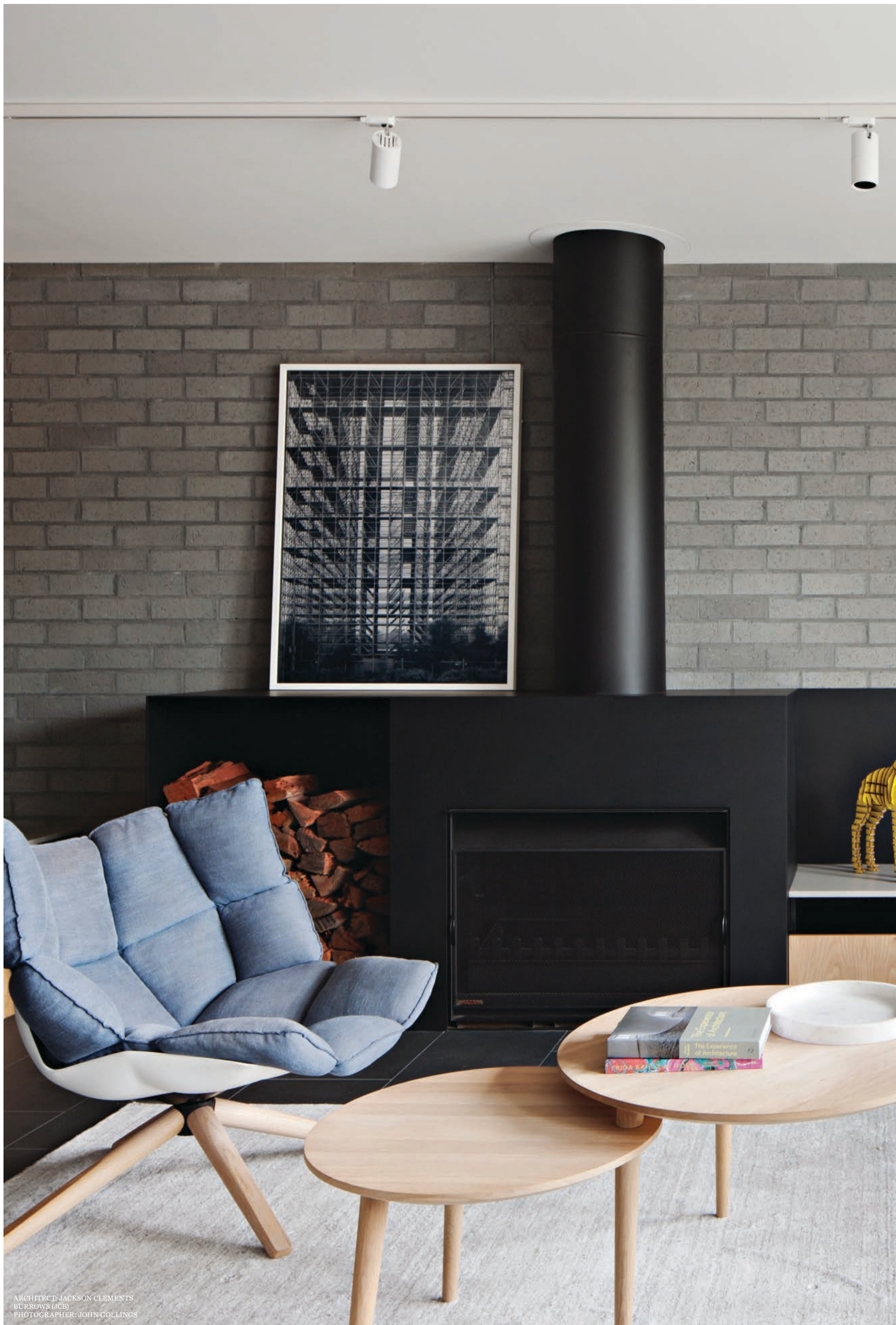
ARCHITECT: JACKSON CLEMENTS BURROWS (JCB)