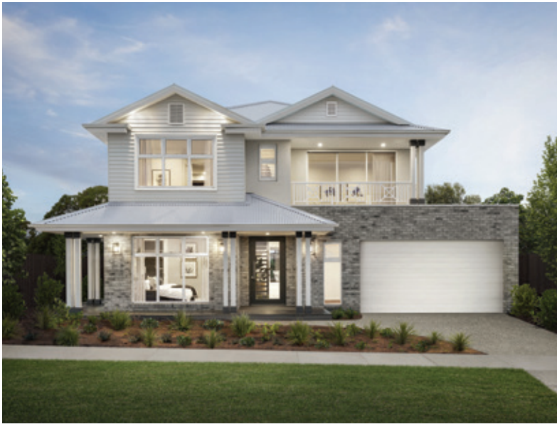
Classic Hamptons p20

Explore Australia's most popular house styles and discover your design direction with our how-to guide to home exteriors.