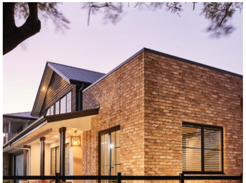
Modern Farmhouse p30