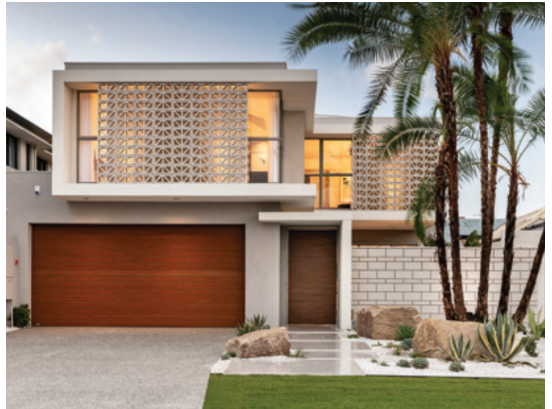
Palm Springs Modern p22