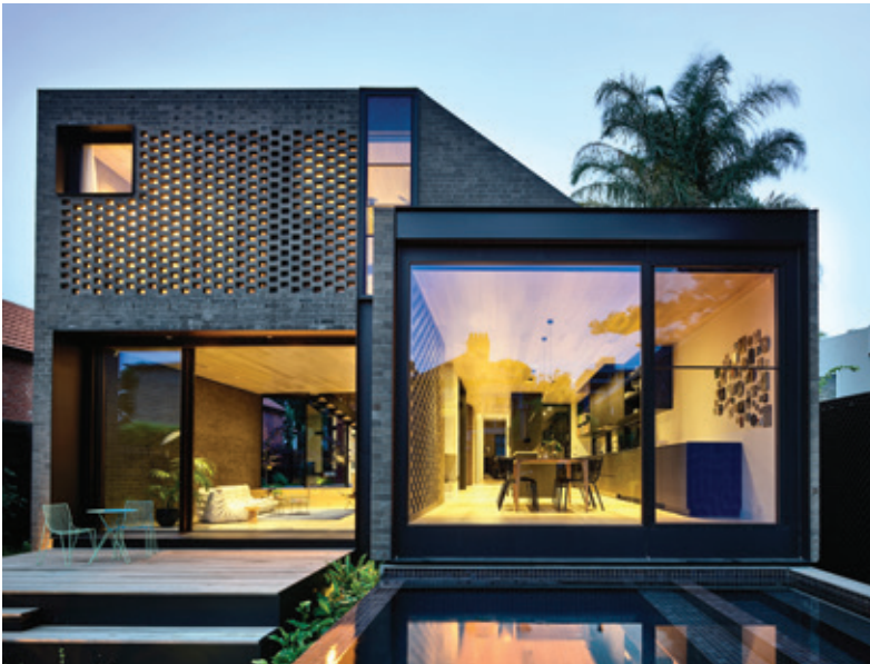
Industrial Urban p24