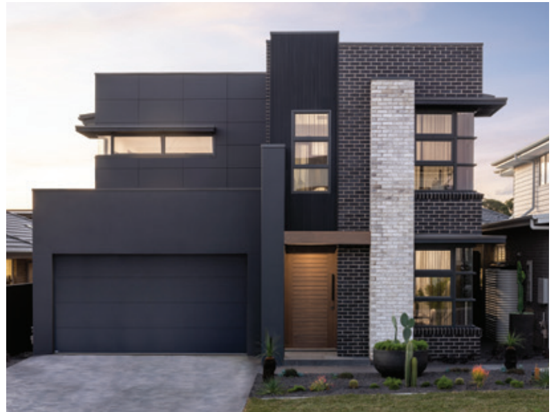
Box Modern p26