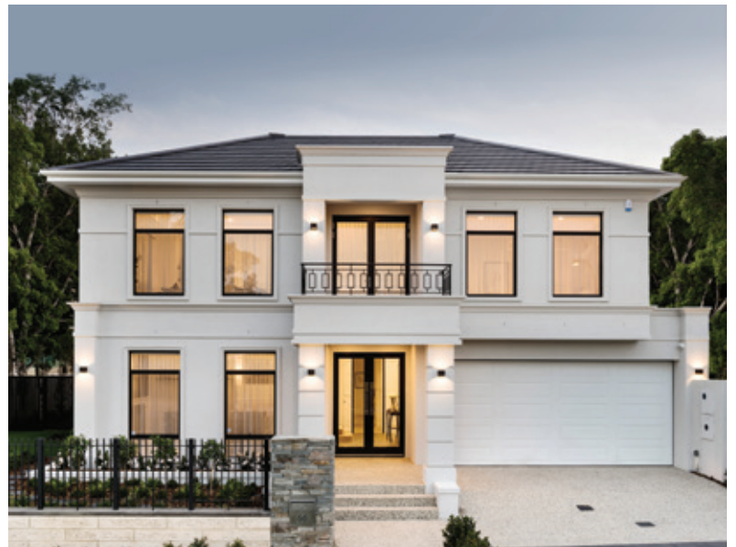
French Provincial p34