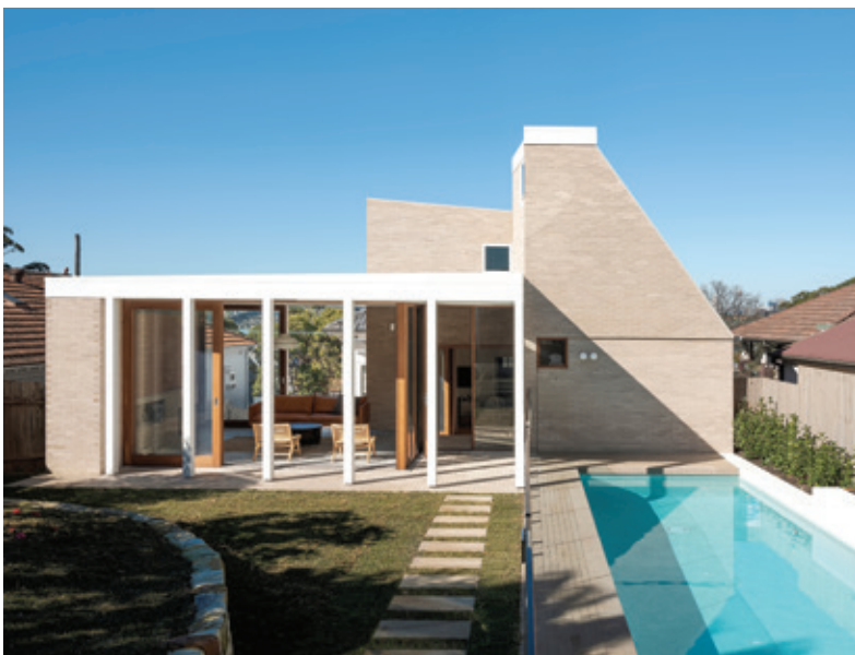
Natural Contemporary p28