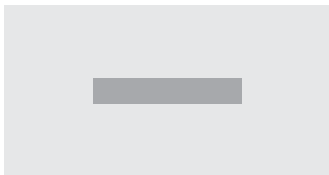
Explorer 200 | 1200L*