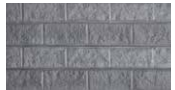
Graphite | Sandstone