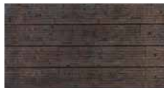
Oak | Slate