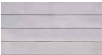
Grey | Smooth