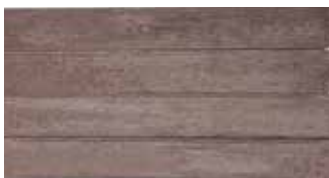
Ironbank | Timberlook