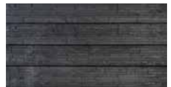
Charcoal | Slate