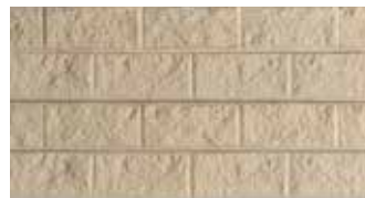
Natural | Sandstone