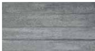
Gumtree | Timberlook