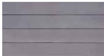
Charcoal | Smooth