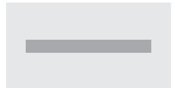
Explorer 200 | 2000L