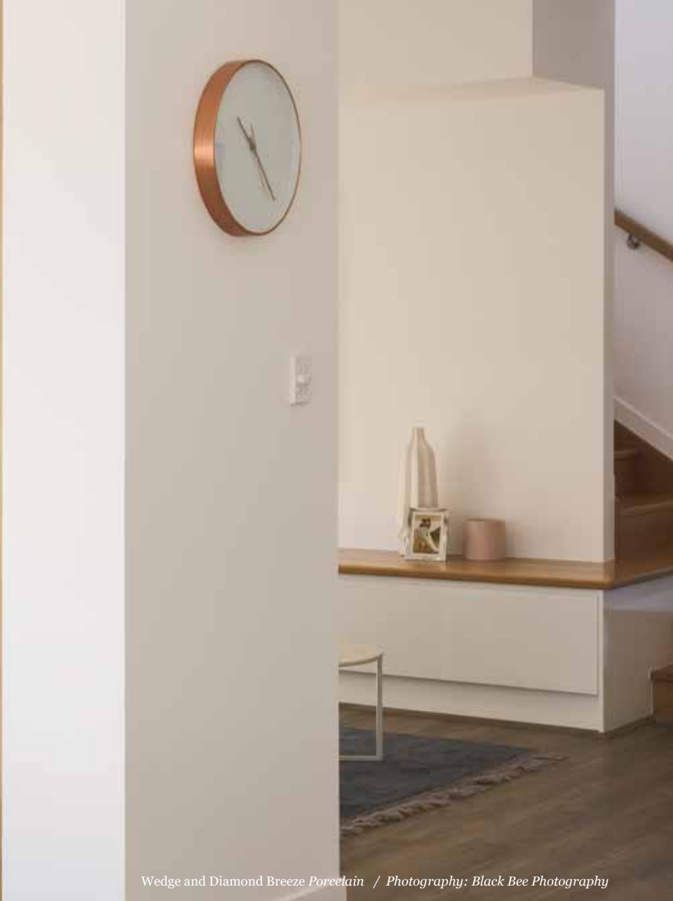
Wedge and Diamond Breeze Porcelain