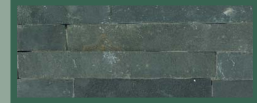
Valley Coal 400 x 125mm