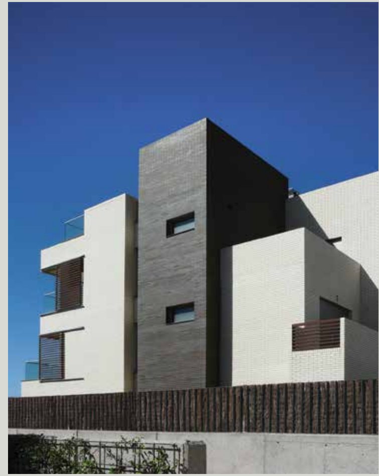
Above: The colours of La Paloma bricks are extremely clean and even.

La Paloma bricks will be available through Austral Bricks' nationwide Design Centre network and selected resellers.