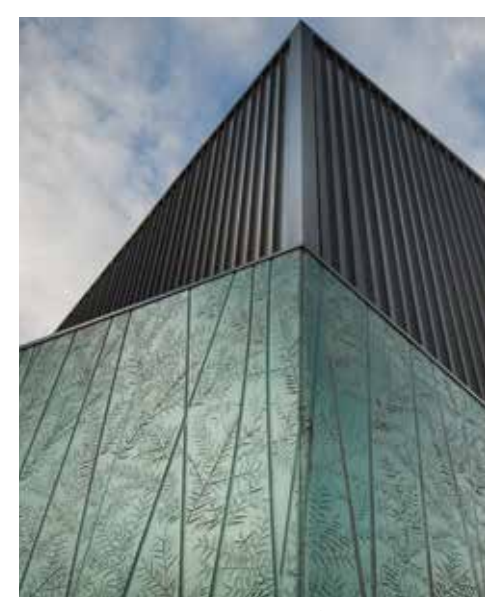
Above: The Nepean Mental Health Centre walls are finished in an engraved bamboo pattern and coloured using Austral Precast's PermaTint system.

"The design sought to create a building that fits with the colour palette of the surrounding environment," explains Domenic Alvaro, principal of architects Woods Bagot. "The copper green colour and natural patina of the precast concrete panels has depth and tactility, providing a unique 'on weathering' finish that will continue to evolve over time."