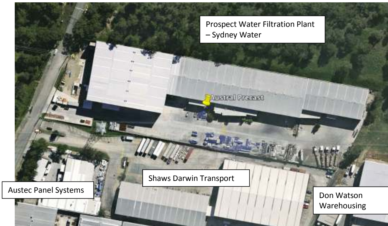
Map Not to Scale.