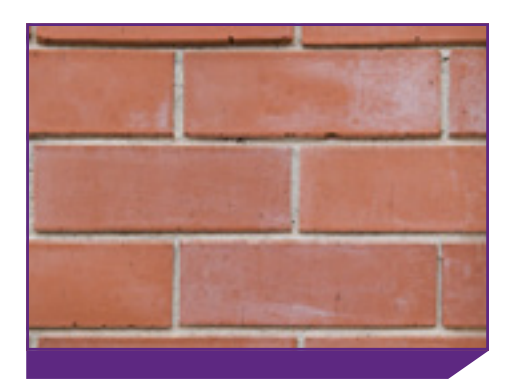
Typical calcium stain from wet sponging mortar joints