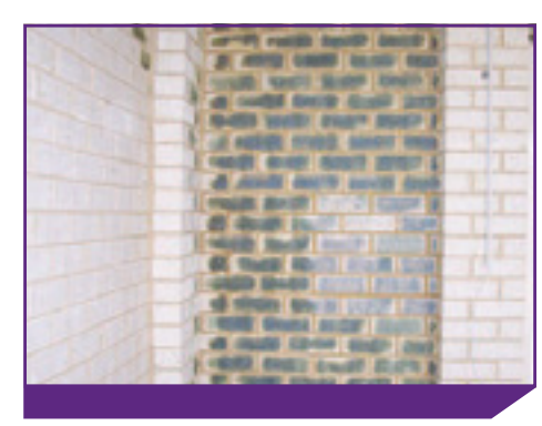
Vanadium stain not removed prior to hydrochloric acid application