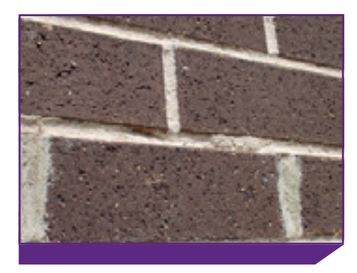
Damage to ironed mortar joint