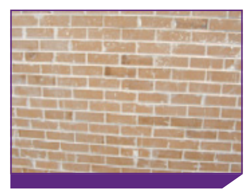
Typical wall after brick laying