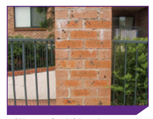
Acid burn on face brick work

Pre-wetting and frequent washing off is designed to prevent undue penetration of the acid into the brick and mortar where further reactions and staining often occur. Window sills and corners require particular attention with pre-wetting as the water readily runs off instead of being absorbed.