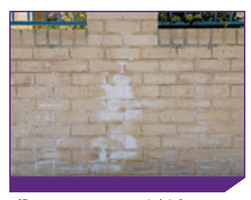
Efflorescence as seen on brick faces

Persistent efflorescence may be a warning that water is entering the wall through faulty copings, flashings or pipes.