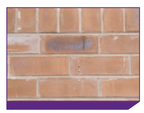
Signs of manganese staining