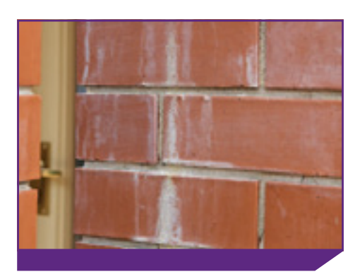
Calcium stains leaching from adjacent concrete balcony