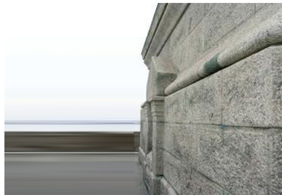
Fig 9 Copper stains on face block work

These stains are caused by water run-off from roofs and fittings, which leave green markings on the block surface.