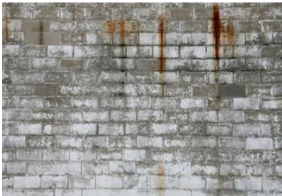
Figure 8 Acid burn on concrete masonry block

Characterised by its yellow to earthy orange rust like colour, these blemishes appear on masonry where oxides are added to deliver a coloured finish. Rust and copper stains occur usually as a result of the misuse of hydrochloric acid in the cleaning of concrete masonry blocks.