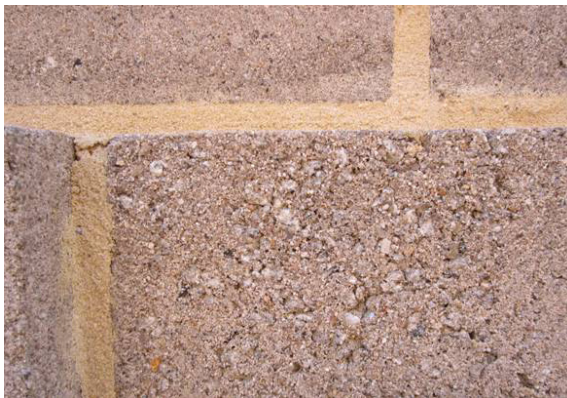
Figure 3 Damaged block wall due to high pressure cleaning