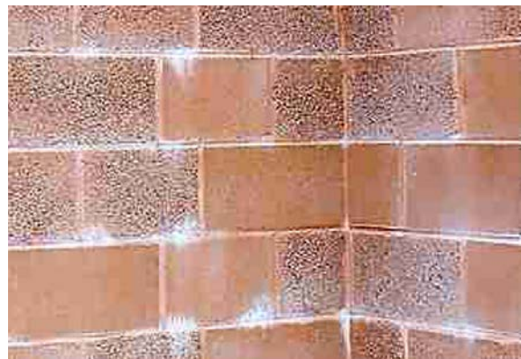
Figure 5 Efflorescence as seen on block faces (a)