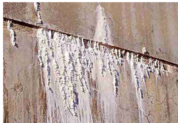
Figure 6 Efflorescence as seen on block faces (b)