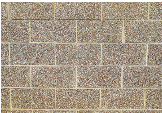
Figure 2 Typical block wall after laying (b)