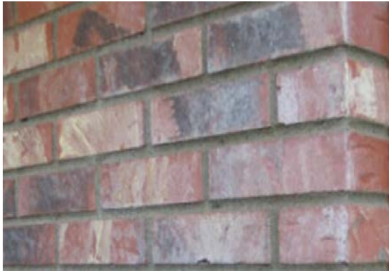
Figure 7 Calcium carbonate on face block work