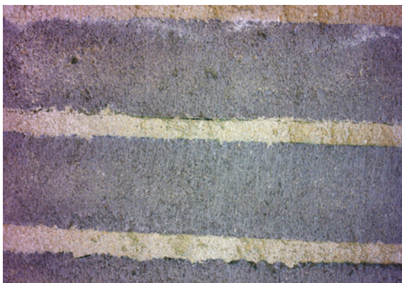
Figure 4 Damaged block wall due to incorrect use of pressure cleaning