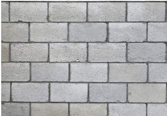
Figure 1 Typical block wall after laying (a)

The cleaner the block layer leaves the wall the easier the cleaning task will be. However, in most cases, some additional cleaning will be required to achieve the desired outcome. Basic cleaning advice and techniques are detailed in this section.