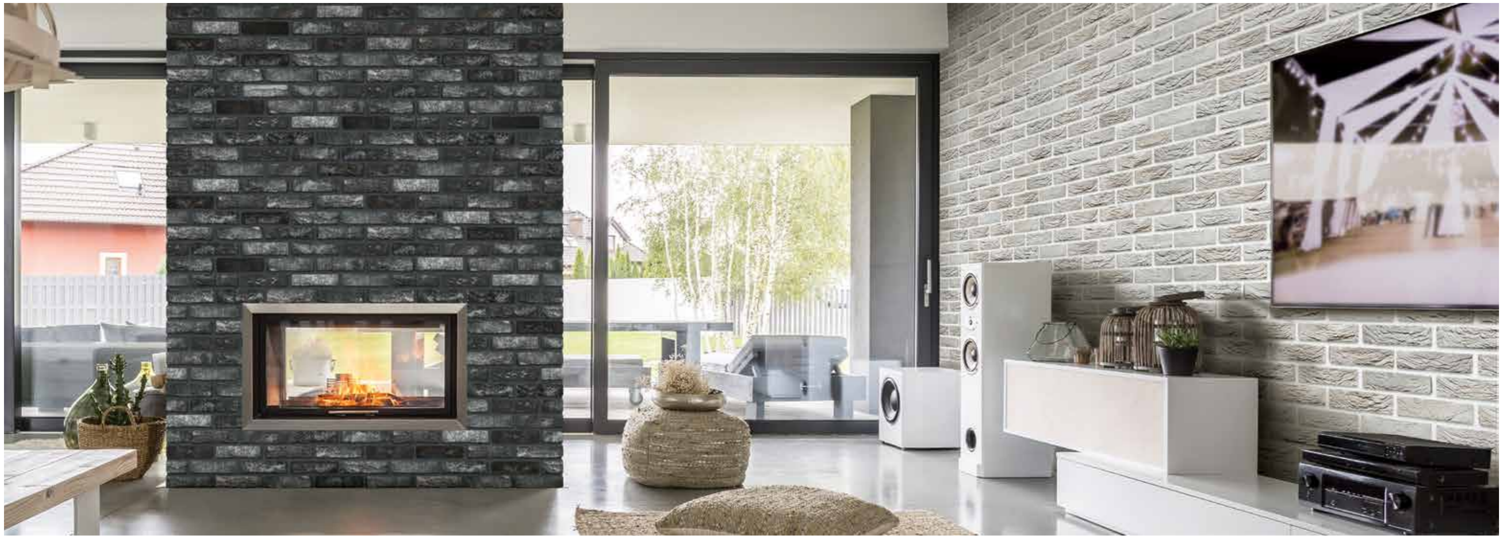
San Selmo Smoked: Wild Storm (dark grey mortar) & Grey Cashmere / Cover Image: San Selmo Smoked: Grey Cashmere