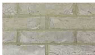
Grey Cashmere** ** Displayed with grey mortar