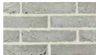
Grey Cashmere* *Displayed with off white mortar

Kiln-fired in Italy, San Selmo Smoked clay bricks offer a subtle tonal palette designed specifically for contemporary architectural projects. The range is characterised by an elegant and carefully graduated selection of colours from pale hues through to the steely blue-greys.