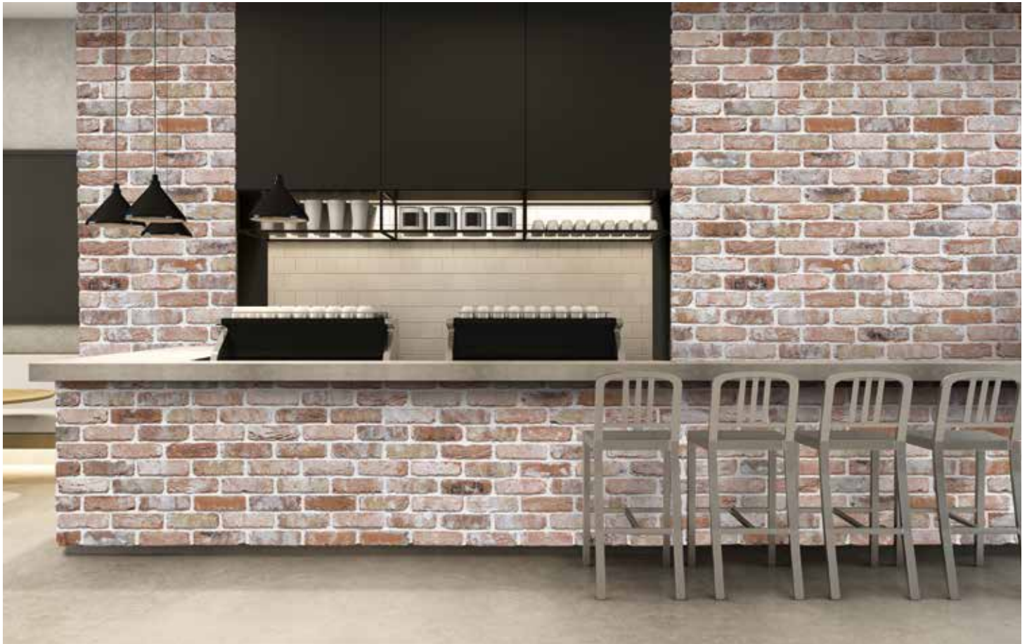
San Selmo Reclaimed

Available in a solid 230 L x 110 W x 76 H mm as well as facing and corner facings.